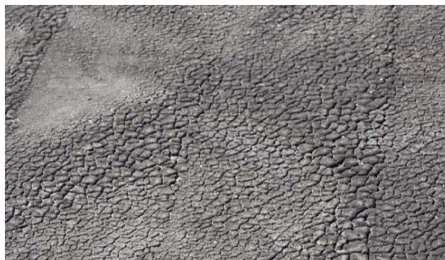
Alligating of Modified Bitumen Roof